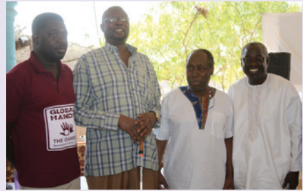
guest speakers in 2017

For more information visit www.questioningthelogic.our.dmu.ac.uk